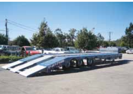
Load 'N' Lift Widener