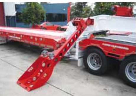
Tuff Ezy Lift Tyre Carrier

equipment and products to manufacture its trailers. State-of-the-art 3D design software is used to design all of its trailers which also enables customers to visualise what the trailer will look like before production begins. Tuff Trailers recognises the varied needs of transport operators and prides itself on being a true custom builder. This has resulted in the continued evolution of many of its designs and the constant addition of entirely new concepts. Denis asserts that Tuff Trailers plans to keep on developing innovative new trailers to cater to the growing needs of his customers. "At Tuff Trailers we always look to the future and hope to continue developing strong and ethical