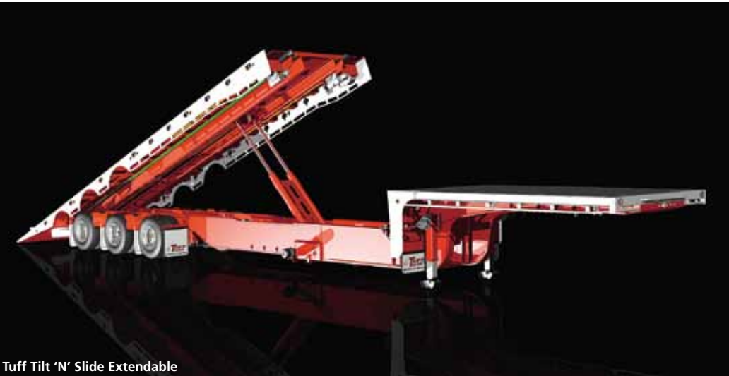
Tuff Tilt 'N' Slide Extendable