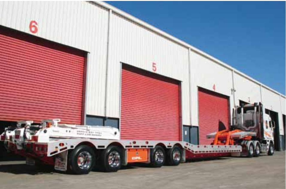
Tuff Low Riders

As well as developing a wide range of innovative trailer designs, Tuff Trailers has developed the Tuff Ezy Lift Tyre Carrier. Designed to eliminate injuries associated with retrieving tyres manually, the Tuff Ezy Lift Tyre Carrier lifts the tyres so that they can be moved to the side and lowered to easily remove the tyres – all with a simple push of a button. Tuff Trailers prides itself on using only the best