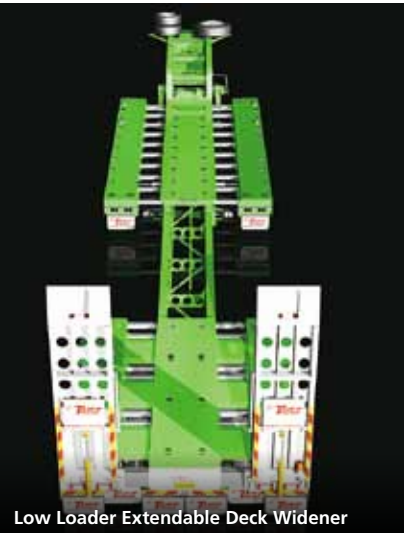
Low Loader Extendable Deck Widener